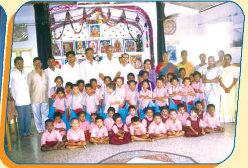
Children participating in various activities