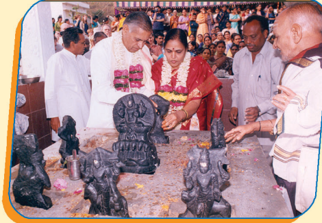
Nava Graha Mandapam