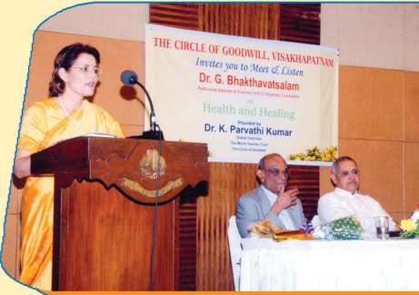
Conducting Global Seminar on Health and Healing by eminent doctors