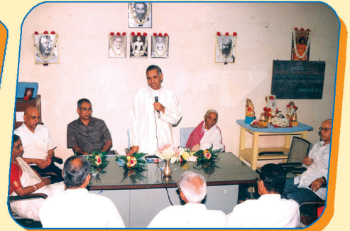
Inauguration of Kasyapa Health Centre