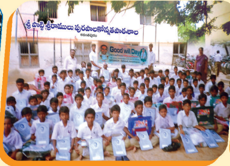
Sri Potti Sriramulu Municipal School, Anathapur