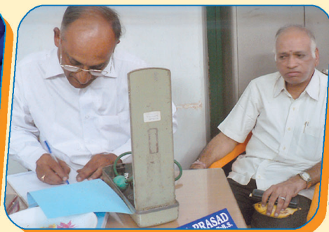
Dhanvantari General Health