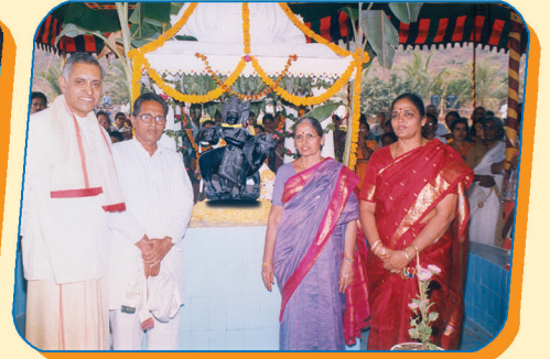
Sri Gopala Krishna