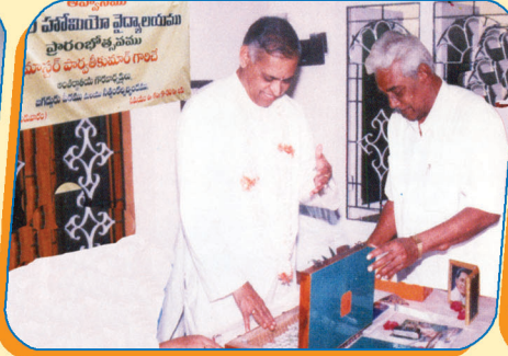
P.M. Palem Homoeo Dispensary