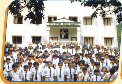
Balabhanu Vidyalayam, Visakha