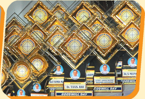
Recognising the merit

Reimbursement of fees, books, clothing for elementary, high school, college, professional courses