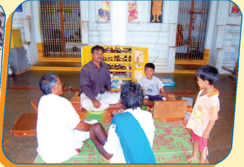
Ranasthalam, SKL, Homoeo Dispensary