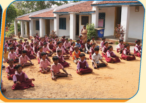
Children enjoying the nature and various benefits