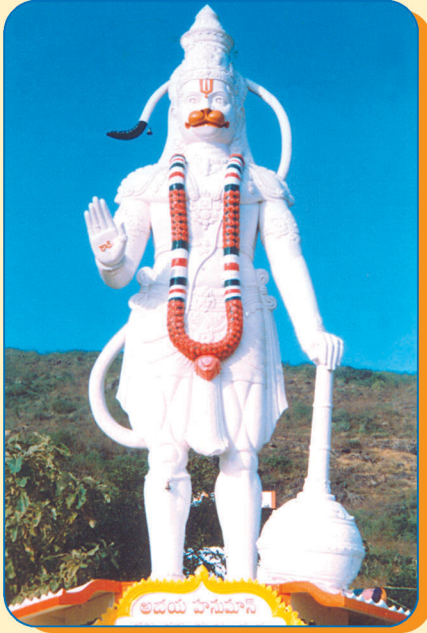
Abhaya Hanuman at Ramadri symbol of protection