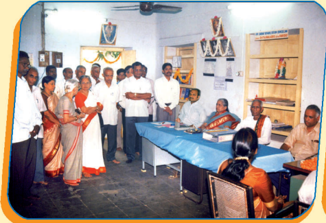
Kasyapa composit health centre East Point Colony, Visakha