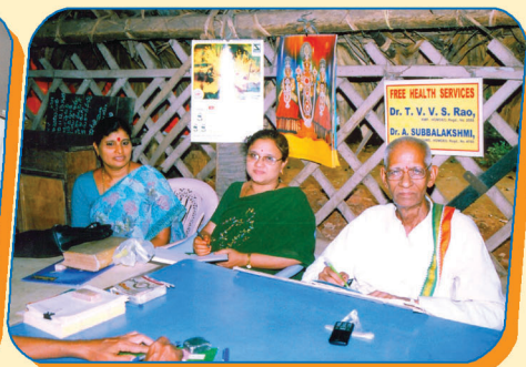
Homeo Clinic at Parnasala