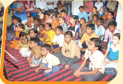
Various schools children