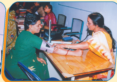
Ardra Cardiac Rehabilitation