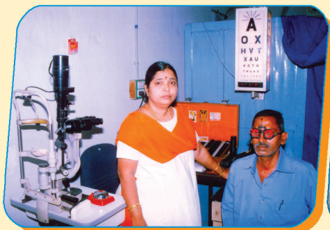
Aswini Eye Services