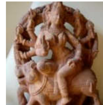
The Goddess Durga on a Tiger