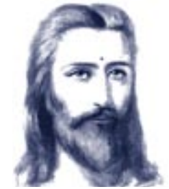
Master Koot Hoomi - Devapi Maharshi -

Do not be crazy of us. Learn to improve upon your ability, purity, and readiness to serve. This is the only way. This is the only clue.