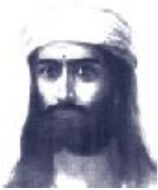
Master Morya - Maruvu Maharshi -